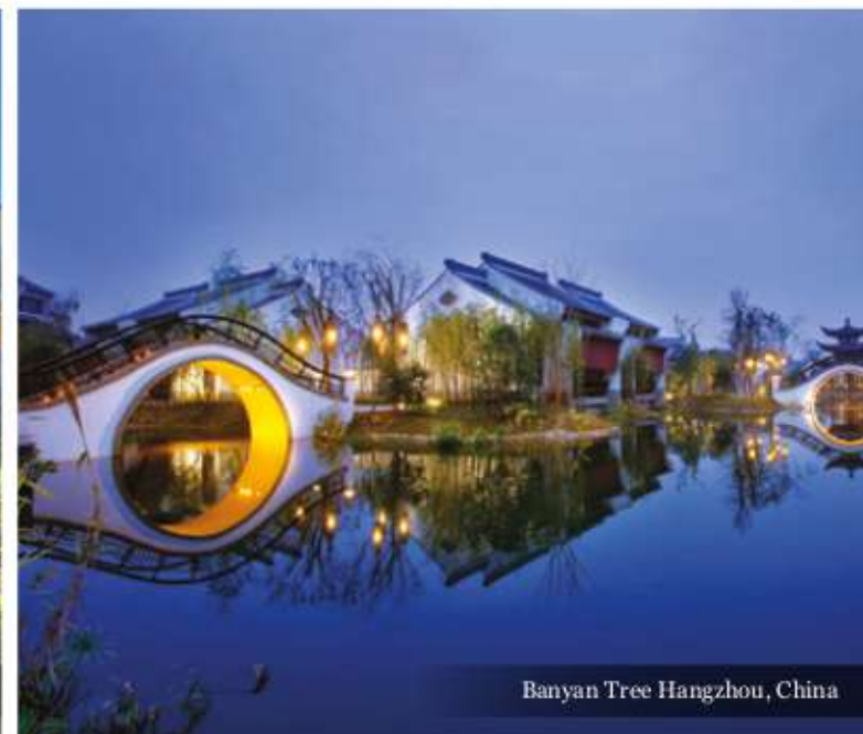
Banyan Tree Hangzhou, China