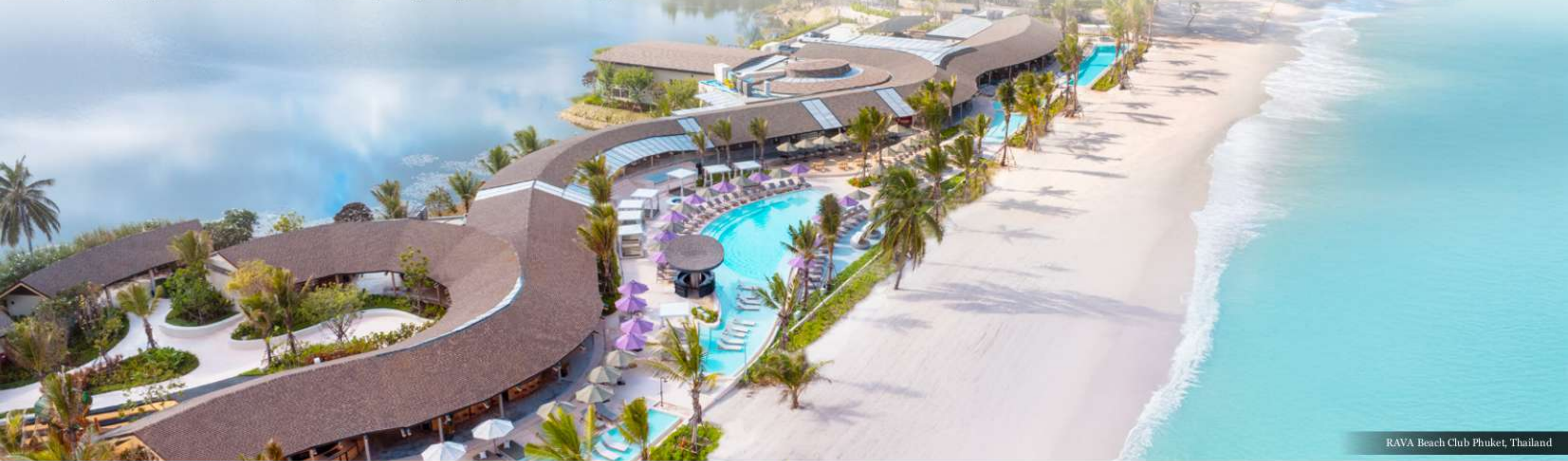
RAVA Beach Club Phuket, Thailand

Beyond an extensive suite of exceptional services and amenities, homeowners will benefit from the professional and hassle-free management of their property as part of Garrya Phuket Hotel's exclusive collection. In addition, the Laguna Advantage programme also offers a range of services to make their life in Phuket more seamless and comfortable. Embrace luxurious beachfront living and enjoy basking in a state of utmost comfort and peace of mind.