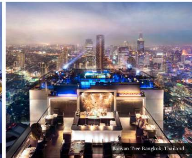
Banyan Tree Bangkok, Thailand