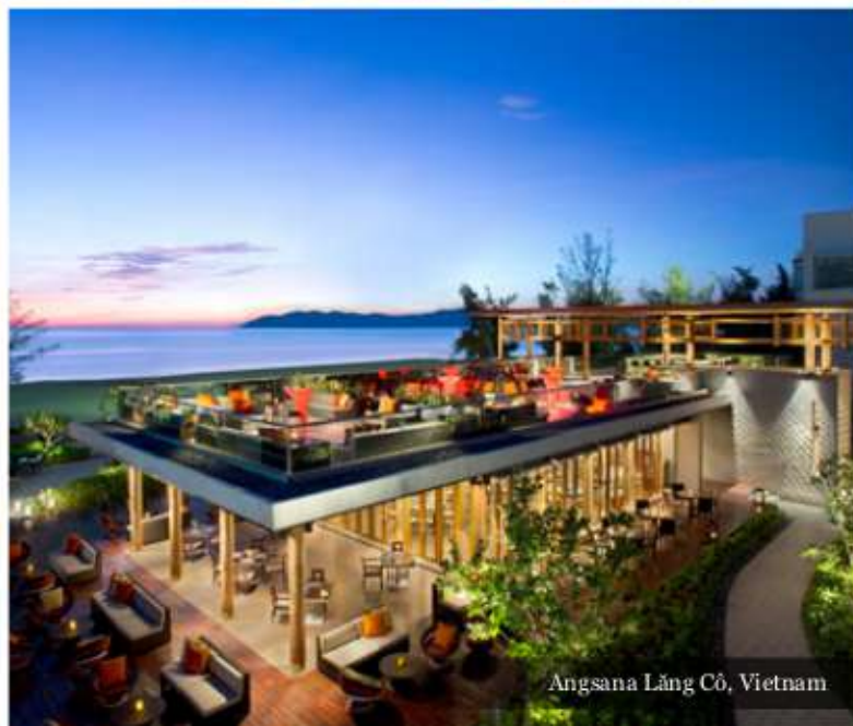
Angsana Lăng Cô, Vietnam